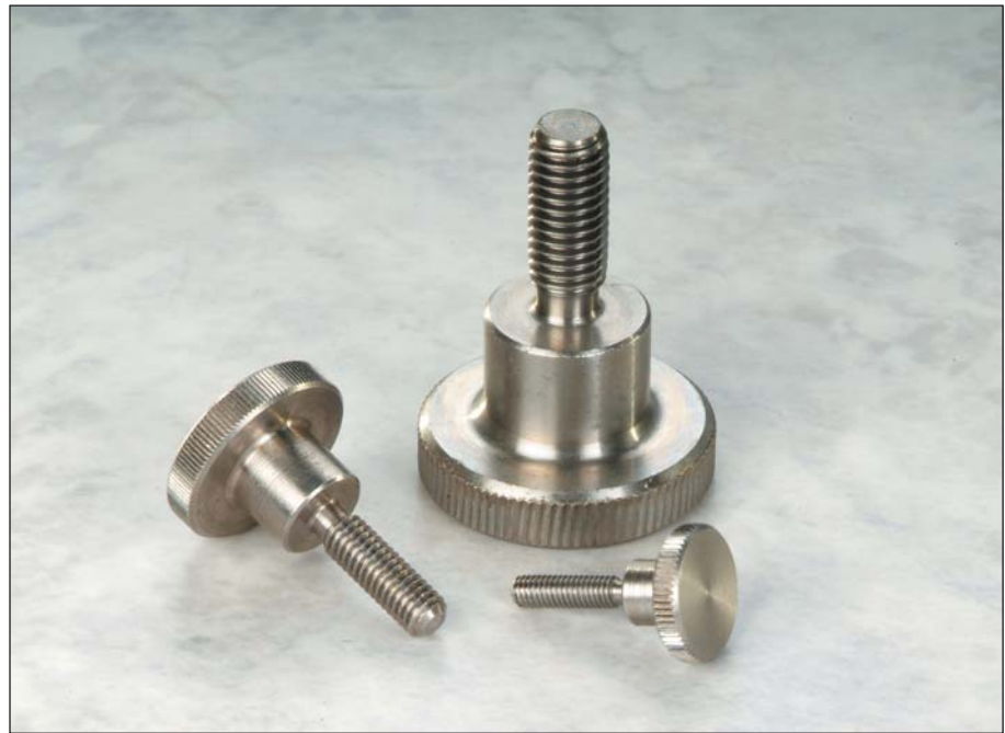
Photo showing the stainless steel version

Product also available in stainless steel .